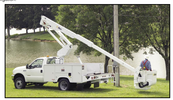
Easy Access From Ground

Altec Aerial Devices meet or exceed all applicable ANSI Standards as of the date of manufacture. Altec reserves the right to improve models and change specifications without notice or obligation.