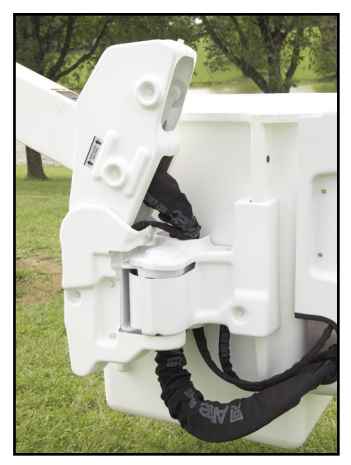
Boom Tip Covers

sales@altec.com Sales – 800-958-2555 Service – 877-GOALTEC