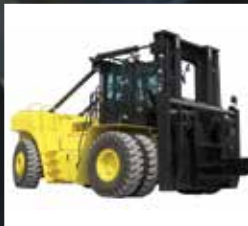
Issue(s) detected by RemoteTech