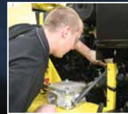
Issue(s) addressed by service tech